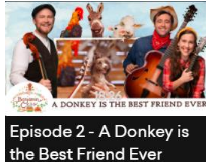
Episode 2 - A Donkey is the Best Friend Ever